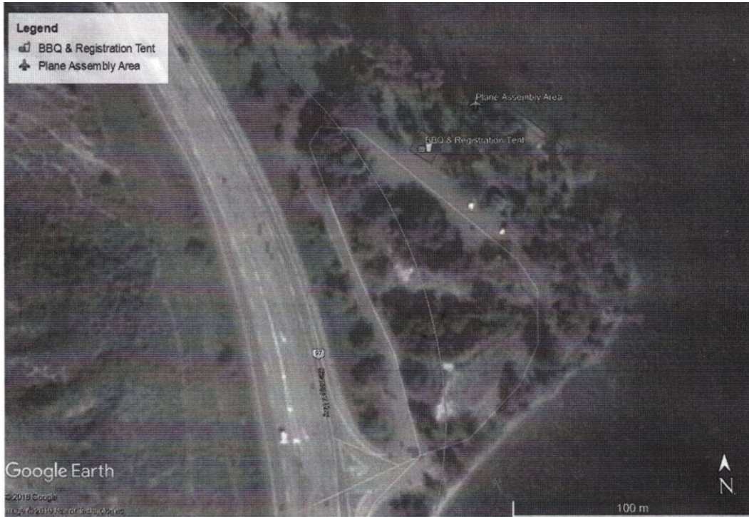
Site Flying area diagram.